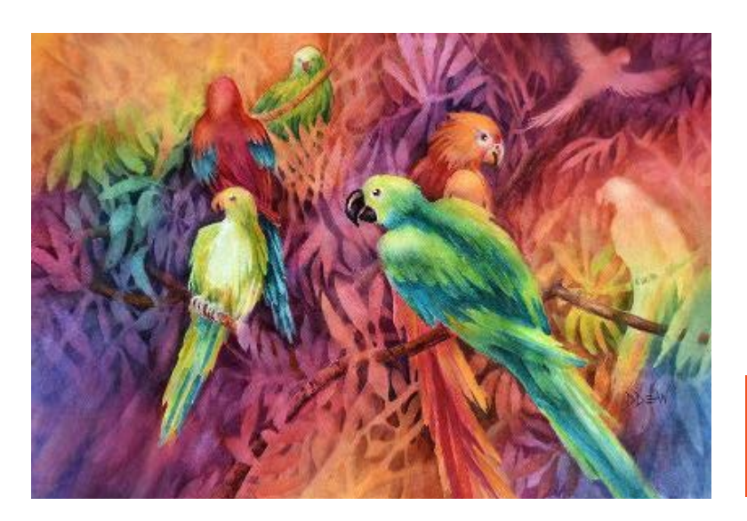
Exhibit opens: Oct. 2, 2023 Exhibit closes: Dec. 21 st, 2023

Gallery hours, Mon-Thursday, 9am to 3pm Location: 137 S. Mill St., Fergus Falls, MN