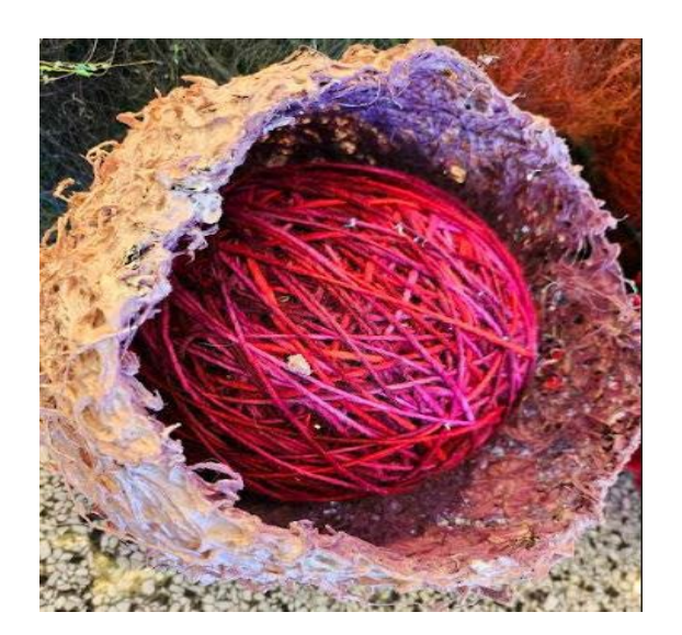
Exhibit opens: Jan. 8, 2024 Exhibit closes: March 14, 2024 Closed March 15-April 12th for cleaning Gallery hours, Mon-Thursday, 9 am to 3 pm Location: 137 S. Mill St., Fergus Falls, MN