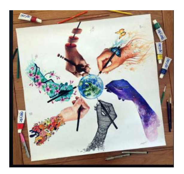
Exhibit opens: Jan. 8, 2024 Reception: Tuesday, Jan. 16th from 5:30 pm - 7 pm Exhibit closes: March 14, 2024 Gallery hours, Mon-Thursday, 9am to 3pm Location: 137 S. Mill St., Fergus Falls, MN