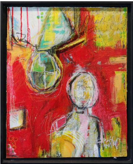
Exhibit opens: Oct. 2, 2023 Exhibit closes: Dec. 21st, 2023 Gallery hours, Mon-Thursday, 9am to 3pm Location: 137 S. Mill St., Fergus Falls, MN