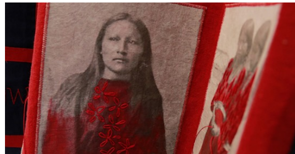
Exhibit dates: July 5 - September 27, 2019 Reception Tuesday, Sept. 17, 5-6:30 pm Gallery hours, M-F, 9-5 137 S. Mill St., Fergus Falls, MN

On loan from All My Relations Arts Gallery in Minneapolis, MN