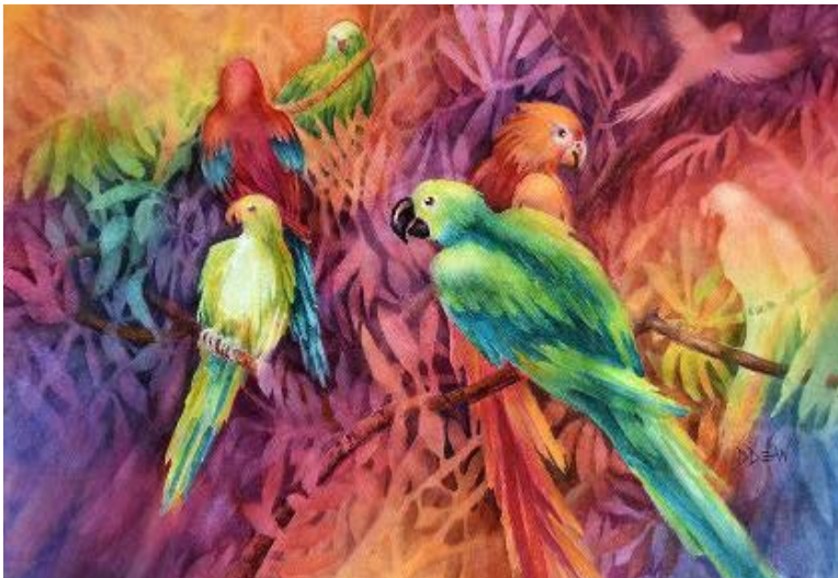
Exhibit opens: Oct. 2, 2023 Exhibit closes: Dec. 21st, 2023 Gallery hours, Mon-Thursday, 9am to 3pm Location: 137 S. Mill St., Fergus Falls, MN