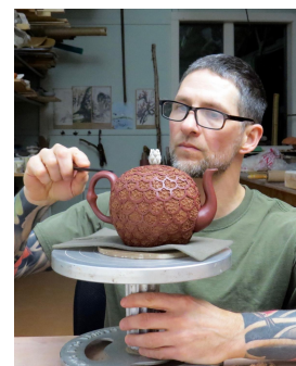
Exhibit: Nov-Dec, 2020

LRAC Solo Gallery 133 S. Mill St. Fergus Falls, MN 56537 218-739-5780