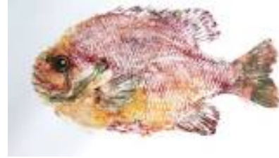
Exhibit dates: April 10 thru May 31, 2019 Gallery hours, M-F, 9-5 137 S. Mill St., Fergus Falls, MN

"I am a long time resident of the Alexandria lakes area having been raised in Henning, MN. I graduated from Concordia College in Moorhead, MN. After retiring from my teaching career in the Alexandria school system I am now able to pursue my own visual and fiber art interests. The journey continues!