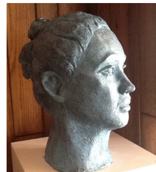
Exhibit dates: May 1 - June 28, 2019 Gallery hours, M-F, 9-5 137 S. Mill St., Fergus Falls, MN