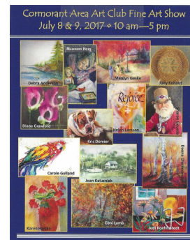
Cormorant Area Art Club Fine Art Show