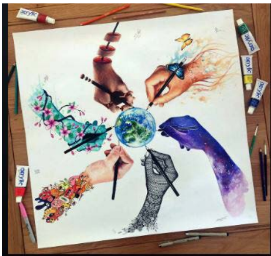
Exhibit opens: Jan. 8, 2024

Reception: Tuesday, Jan. 16th from 5:30 pm - 7 pm