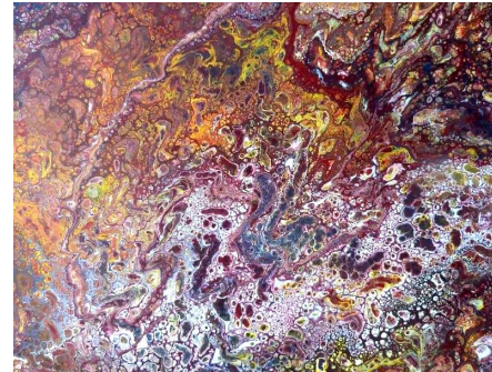
Exhibit dates: February thru March 2019 Gallery hours, M-F, 9-5 137 S. Mill St., Fergus Falls, MN