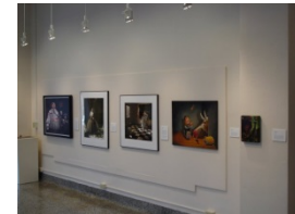
LRAC Solo Gallery