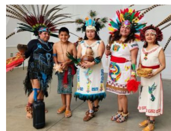
Nahui Olin Dance Troupe will perform at the PRCA community arts festival in 2024.