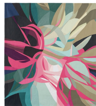
"Lifelines", Machine piecing, machine quilting, by Émilie Trahan. HCSCC will host a quilt exhibit in 2024.