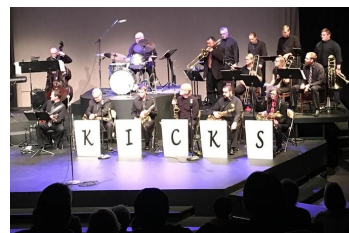
The Kicks Band of Fargo Moorhead will produce an outdoor jazz festival in Moorhead in August 2024.