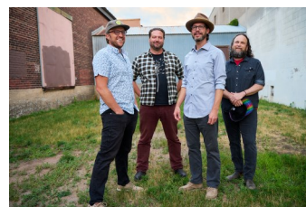
"Pert Near Sandstone" will perform in Vergas, MN in June 2024.