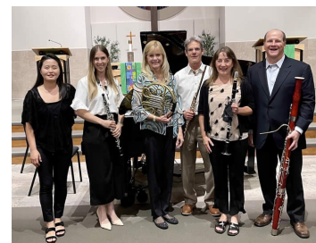
Guest artists pose for a picture at the 2022 Lakes Chamber Music Society's Alexandria Festival of the Lakes chamber music series.

Lakes Chamber Music Society will use the grant funds to produce a summer classical chamber music four-concert series, Alexandria Festival of the Lakes, and to pay for specific event production expenses: concert venue rental, concert programs, performance licensing fees (ASCAP), and piano tuning. The concerts will take place at 7PM on August 7, 10, 14, and 18, 2024 respectively. All concerts will be held at First Lutheran Church, 1655 18th Avenue, Alexandria, MN.