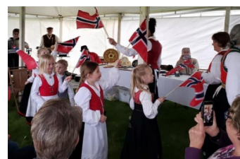
A photo from a previous "barnetog" hosted by Immanuel Church Building Association in 2022.