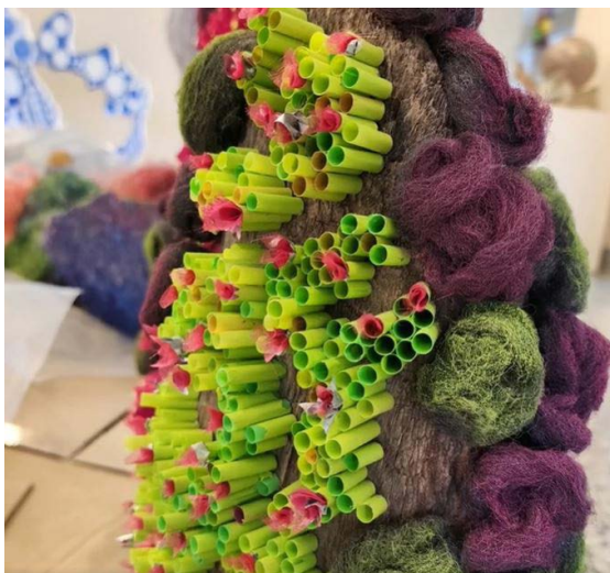
Exhibit opens: Jan. 8, 2024

Reception: Tuesday, Jan. 16th from 5:30 pm - 7 pm